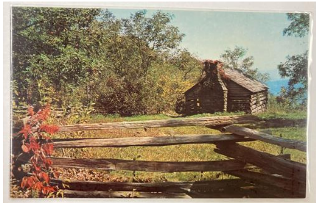
Old Mountain Cabin, Blue Ridge Parkway, VA, 20th C. (VMHC 1999.17.851)

Shenandoah National Park is a beautiful natural area perfect for recreation. It holds over 500 miles of trails, 654 campsites, and lots of wilderness. However, this area wasn't always a park. It used to be home to many different groups of people ( communities! ) through history. At least 500 families once lived within the bounds of what is today Shenandoah National Park. The families who called the Shenandoah Mountains home were displaced by the creation of the park and were forced to leave. They would have lived in cabins much like the one pictured on this postcard.