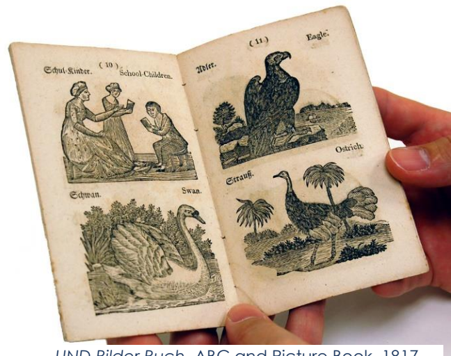
UND Bilder Buch, ABC and Picture Book, 1817 (VMHC Rare PF 3114 H38 1817)

Beginning in the 18 th century, European settlers began to move further westward into Virginia. The initial waves of settlers were mostly made up of Scottish, Irish, and German immigrants. By the early 19 th century as many as three quarters of the population of the northern part of the Valley had German ancestors. Some of them, like the Henkel family, found ways to preserve their culture. The Henkel family started a printing business that focused on materials printed in German, like this children's book.