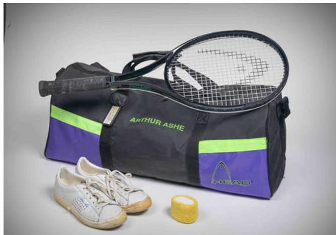
Arthur Ashe Tennis Equipment, 20th c. (VMHC 2001.556, 2005.326.1-3, 2005.326.5)

Arthur Ashe was a tennis champion from Richmond, Virginia. During high school he moved to Missouri in order to train on courts that were not as strictly segregated. Ultimately, Arthur Ashe became the number one tennis player in the world, and became the first African American to win the men’s singles championship at Wimbledon. As an adult he spent his life mentoring youth and speaking out against racism.