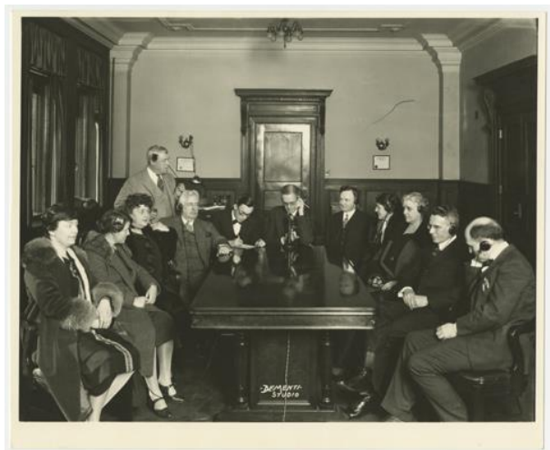
First Transatlantic Telephone Call, 1915 (VMHC 2002.299)

Ring ring! In 1915, the first Trans-Atlantic (across the Atlantic Ocean) telephone communication happened between Arlington, VA and Paris, France. This is a reminder that Virginia is an important part of United States history, but also the history of the world. How do you think the ability to call people across the ocean change people's lives and jobs?