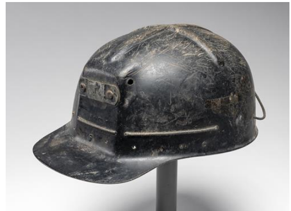
Coal Mining Helmet, 20th c. (VMHC 1991.24.3)

Southwest Virginia is known for mountains, music, and mining. In 1872, the discovery of large, high-quality coal fields transformed southwest Virginia. Steam locomotives—powered by coal—carried the products of the mines to Norfolk and Newport News for export worldwide. People flocked to this region and companies set up towns where employees lived. However, coal mining is extremely dangerous. Hazards include suffocation, gas poisoning, roof collapse, gas explosions, and dangerous diseases such as black lung. This, in combination with changing forms of energy, has put the coal industry into decline.