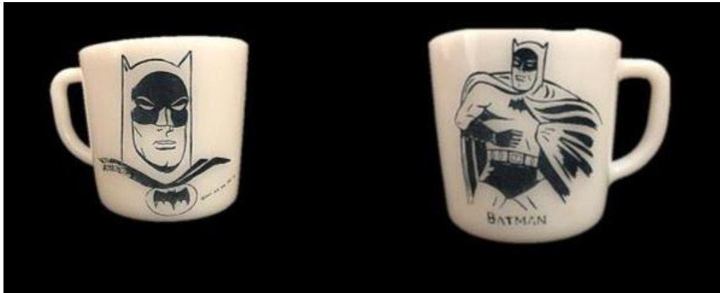
Batman mug, 1966

As a child growing up in the 1960s, I was an avid consumer of pop culture, which both entertained and fueled my imagination. I was six years old when the Batman television series starring Adam West and Burt Ward debuted in 1966. I was immediately captivated by the dynamic duo for their valor, ingenuity, and the seemingly endless plethora of Bat-gizmos used to fight crime (who didn't want a spin in the Batmobile?). Of course, I had to demonstrate my loyalty by purchasing all things Caped Crusader – Halloween costume, lunchbox, action figures...and this mug. The other vestiges of my Batmania chapter have long since disappeared, but the mug remains – like Charles Foster Kane's sled "Rosebud" - a fond reminder of the good, gone days of my youth.