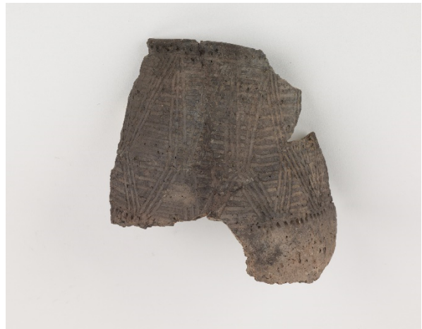
Ceramic Bowl, about 1000

Indigenous Virginians in the Tidewater region traditionally created pottery using a coil method – laying coils on top of one another before pinching them together to create a solid wall. The surface would then be smoothed out and decorated by creating textures with fabric, cord, or net. Archaeologists can trace different Native communities through time and place by observing changes in pottery, housing, or tools between groups. Today, descendants connect to the past through learning these pottery traditions.