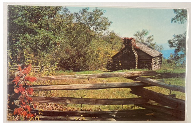
Old Mountain Cabin, Blue Ridge Parkway, VA, 20th c.

Shenandoah National Park is a beautiful natural area perfect for recreation. It holds over 500 miles of trails, 654 campsites, and lots of wilderness. However, this area wasn't always a park. It used to be home to many different groups of people ( communities! ) through history. At least 500 families once lived within the bounds of what is today Shenandoah National Park. The families who called the Shenandoah Mountains home were displaced by the creation of the park and were forced to leave. They would have lived in cabins much like the one pictured on this postcard.