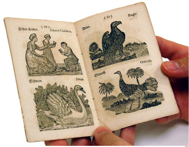
UND Bilder Buch, ABC and Picture Book, 1817 (VMHC Rare PF 3114 H38 1817)

Beginning in the 18 th century, European settlers began to move further westward into Virginia. The initial waves of settlers were mostly made up of Scottish, Irish, and German immigrants. By the early 19 th century as many as three quarters of the population of the northern part of the Valley had German ancestors. Some of them, like the Henkel family, found ways to preserve their culture. The Henkel family started a printing business that focused on materials printed in German, like this children's book.