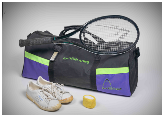
Arthur Ashe Tennis Equipment, 20th c. (VMHC 2001.556, 2005.326.1-3, 2005.326.5)

Arthur Ashe was a tennis champion from Richmond, Virginia. During high school he moved to Missouri in order to train on courts that were not as strictly segregated. Ultimately, Arthur Ashe became the number one tennis player in the world, and became the first African American to win the men's singles championship at Wimbledon. As an adult he spent his life mentoring youth and speaking out against racism.