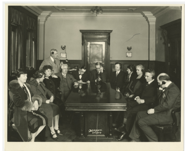
First Transatlantic Telephone Call, 1915 (VMHC 2002.299)

Ring ring! In 1915, the first Trans-Atlantic (across the Atlantic Ocean) telephone communication happened between Arlington, VA and Paris, France. This is a reminder that Virginia is an important part of United States history, but also the history of the world. How do you think the ability to call people across the ocean change people's lives and jobs?