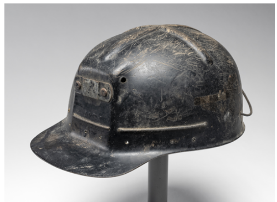
Coal Mining Helmet, 20th c. (VMHC 1991.24.3)

Southwest Virginia is known for mountains, music, and mining. In 1872, the discovery of large, high-quality coal fields transformed southwest Virginia. Steam locomotives—powered by coal—carried the products of the mines to Norfolk and Newport News for export worldwide. People flocked to this region and companies set up towns where employees lived. However, coal mining is extremely dangerous. Hazards include suffocation, gas poisoning, roof collapse, gas explosions, and dangerous diseases such as black lung. This, in combination with changing forms of energy, has put the coal industry into decline.